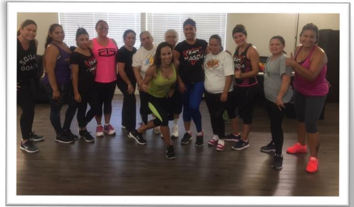
Onsite fitness classes are a bit among residents!

Housing on Merit collaborates with community healthcare providers to bring services to our residents' doorstep. Mobile clinics provide a variety of important health services to our residents, insured or not. With our partners at the San Ysidro Health Center, year to date our mobile clinics have served 83 residents in San Diego by providing school and sports physicals, immunizations, and addressing minor illnesses.