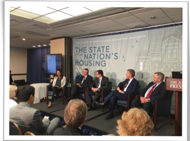
Panelists speaking at The State of the Nation's Housing report release.

Further adding to these conditions, the Tax Cuts and Jobs Act reduced the corporate tax rate and consequentially the value of LIHTC properties. The value of tax credits dropped from over a dollar to ninety cents, leaving affordable housing developers struggling to make up the difference. Over the next ten years as many as 232,000 fewer affordable units will be constructed as a result.