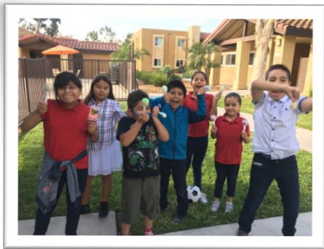
Youth from Rio Vista showing off their hand-made maracas, a common instrument in Hispanic music.

Center for Growth and Empowerment: Mobilizes residents to create a vibrant community reflective of their communal and personal goals.