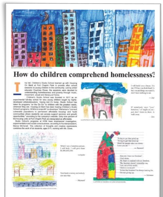
Artwork made by Fort Chaplin youth exploring homelessness, published in the November issue of Street Sense.

Housing on Merit recently partnered with the historic Children's Studio School in Washington, D.C., to incorporate their Arts as Education curriculum into the after-school program at Fort Chaplin Park Apartments. Since its opening in 1977 the Children's Studio School has received numerous awards and accolades for its work with young children in D.C.