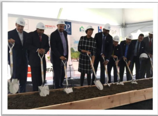
Mayor Bowser with the Capitol Vista development team breaking ground on Capitol Vista.

Housing on Merit along with its development team, Mayor Bowser, and leaders from the Department of Housing and Community Development, Housing Finance Agency, and the Office of the Deputy Mayor for Planning and Economic Development recently broke ground on our Capitol Vista project. HOM is a co-developer of Capitol Vista.