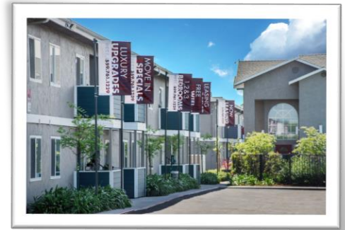
Butterfly Grove Apartments in Fresno, California.

In addition to co-developing, HOM also provides onsite resident services programming at this community.