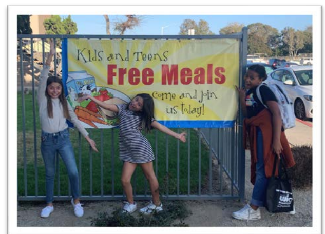
Youth in front of their new banner from Kitchens for Good.