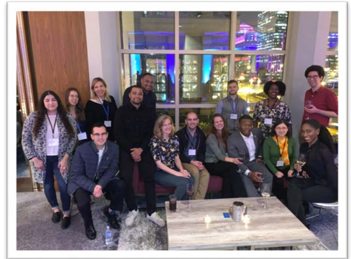
National Housing Conference's Emerging Leaders in Affordable Housing.