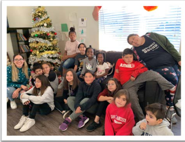
Holiday celebration with residents at Vista La Rosa.

Residents enjoyed holiday and end-of-year activities and celebrations throughout the fourth quarter, with youth programming tailored to reinforce what was learned during the school year. Housing on Merit provided over 760 hours of resident services programming across our communities during the fourth quarter. The following are programming highlights from our Learning Centers: