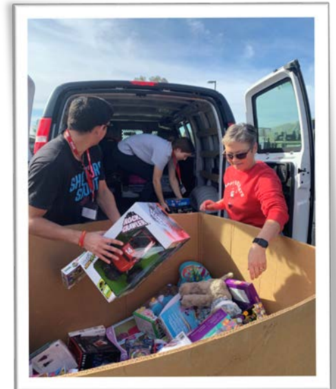
Picking up toys from San Diego Marine Toys for Tots!

Springville Senior residents in Camarillo, California, worked on an assortment of holiday crafts during the weekly Arts & Crafts class. Fall thank you cards, holiday wreaths and dinner platters were some of the most popular items created during the fourth quarter. This very popular program encourages participants to relax in the company of their neighbors while keeping their hands and minds nimble.