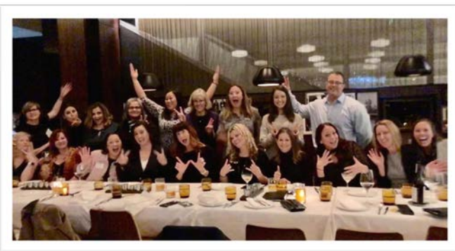
National Delegates from CREW Network’s California Chapters.