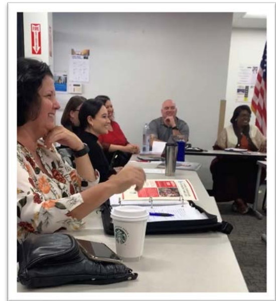
Women Veterans Network Meeting Attendees.