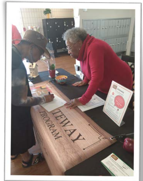
Registering for a Brain Fitness Workshop!

Senior residents at Harriet Tubman Terrace in Berkeley, California, participated in a Brain Fitness workshop, provided through a partnership with the Berkeley Age Friendly Continuum's Gateway Program. The workshop focused on the four pillars of brain health: physical exercise, balanced diet, stress management, brain exercise. Attendees learned examples of each pillar and were treated to healthy brain foods during the workshop. The Brain Fitness workshop was such a success, Housing on Merit plans to offer the workshop to residents on a monthly basis.