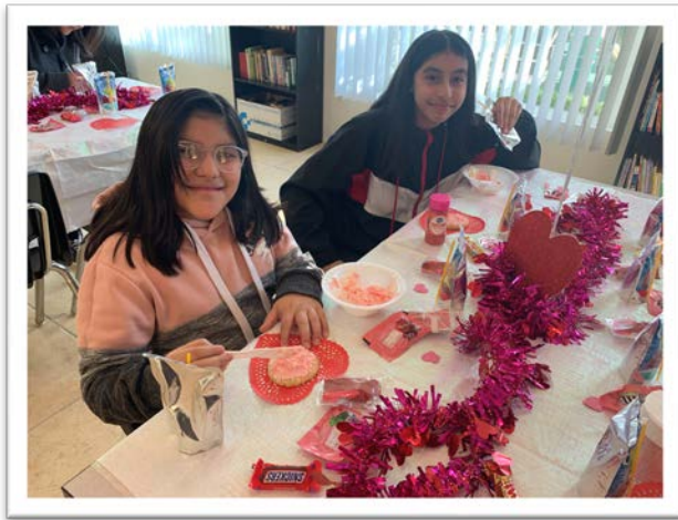
Valentine's Day Cookie Decorating with Sunrose Residents.

Housing on Merit kicked off the new year with stimulating youth, adult, and senior programming and provided over 870 hours of resident services programming across our communities during the first quarter. The following are programming highlights from our Learning Centers: